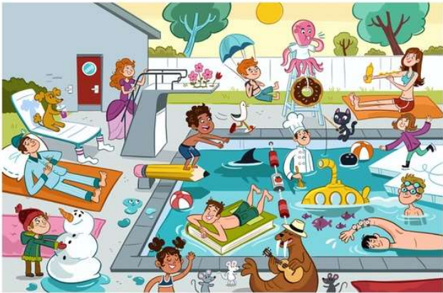
Silly Swim Credit: Highlights Puzzlemans

Example: Loudly the walrus played the guitar beside the noisy swimming pool full of people.